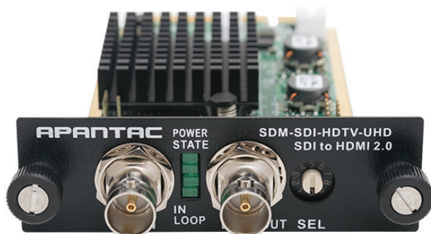
Apantac Interfaces for SDI