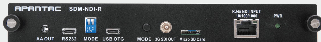
Apantac Interfaces for NDI

Interfaces today support formats up to 4K and even 8K, and those capabilities will extend to address evolving requirements across the broadcast and Pro AV industries. Whether you're working in baseband or AV-over-IP, the Apantac SDM line has an interface to support your video wall or display setup.